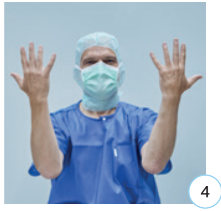
Hands shall be air dry before putting on surgical gloves. Keep hands above elbow level.