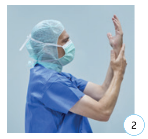
First disinfect hands and forearms up to the elbow with decosept®. Hands and forearms must be kept wet with hand disinfectant according to the manufacturer's instructions for the duration of the declared contact time.